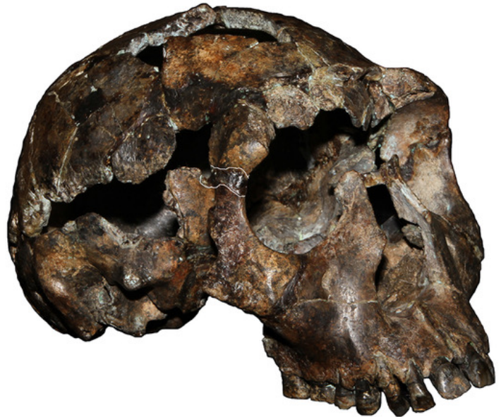
Dr. Richard Leakey altered the photographs of the Turkana Boy and altered the face (above)